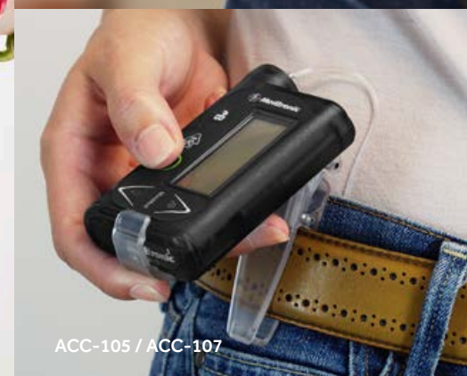
ACC-105 / ACC-107