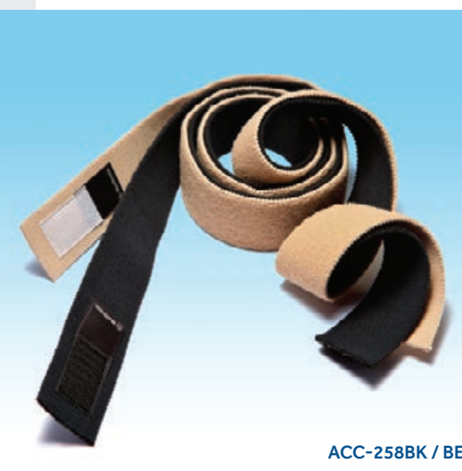
ACC-258BK / BE